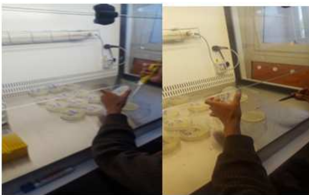
Figure 3. Inoculation of diluted sample and spreading over the agar plate solution.