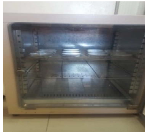
Figure 4. Incubation.