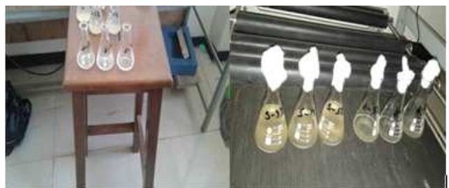
Figure 6. Before and after inoculation of the culture of microorganism into waste water.