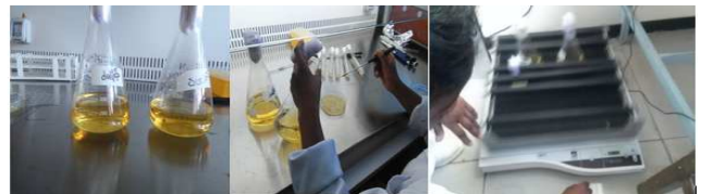
Figure 5. Sterilized nutrient broth solution, transferring colonies into nutrient broth solution and shaking it.

The 10^{-6} and 10^{-5} deep and surface cultivated colonies respectively were taken from incubated Petri dish by loop and added into nutrient broth solution and again covered with aluminum foil and cotton. Then the mixture was putted on shaker and left for 24 hours to allow microbial growth.