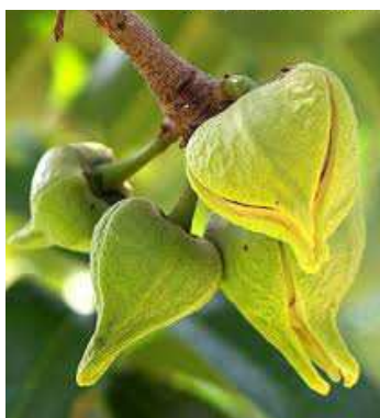
Figure 1. Annona muricata (Soursop) flower at the blooming stage [7].

A. muricata flowers are hermaphrodite, usually fragrant, and solitary or in groups of two or four, with fascicles of three green sepals and six petals arranged in two vertical [7]. It was also opined that the external verticils have three yellow-greenish petals while the internal verticils have three